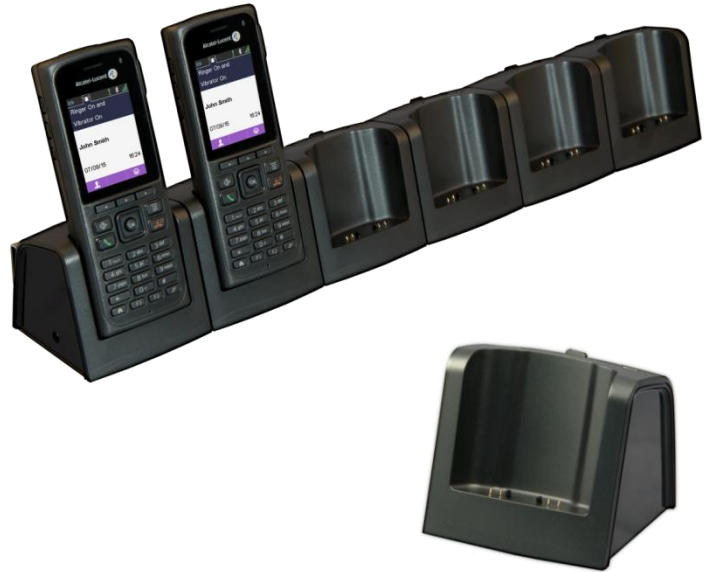
Chargers (single or rack dual charger)